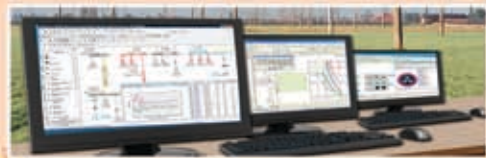
CYME POWER ENGINEERING SOFTWARE